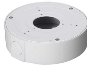
MNT-JUNCTION BOX 1